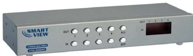
(90-20217) 4 In 4 Out