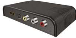
CVBS/S-Video to HDMI converter